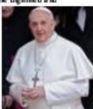
(Pope Francis, July 2014)