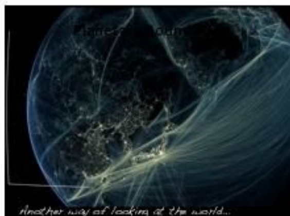
Another way of looking at the world...