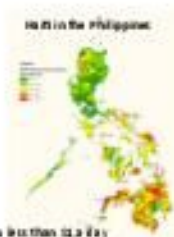
26.5% of Filipinos live on less than 12.2 l/day